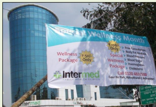
(Above: View of Wellness Month Banner with Intermed Clinic in background)

April is Intermed's Special Wellness month and brings with it a host of special offers and discounted pricing. Wellness services can help prevent the onset of lifestyle diseases such as diabetes, obesity and hypertension which can become major health issues later in life. Come in to Intermed today for a health check and see what you can be doing to help make sure you maintain a high quality of life well into your golden years with assistance from Wellmed's highly trained staff.